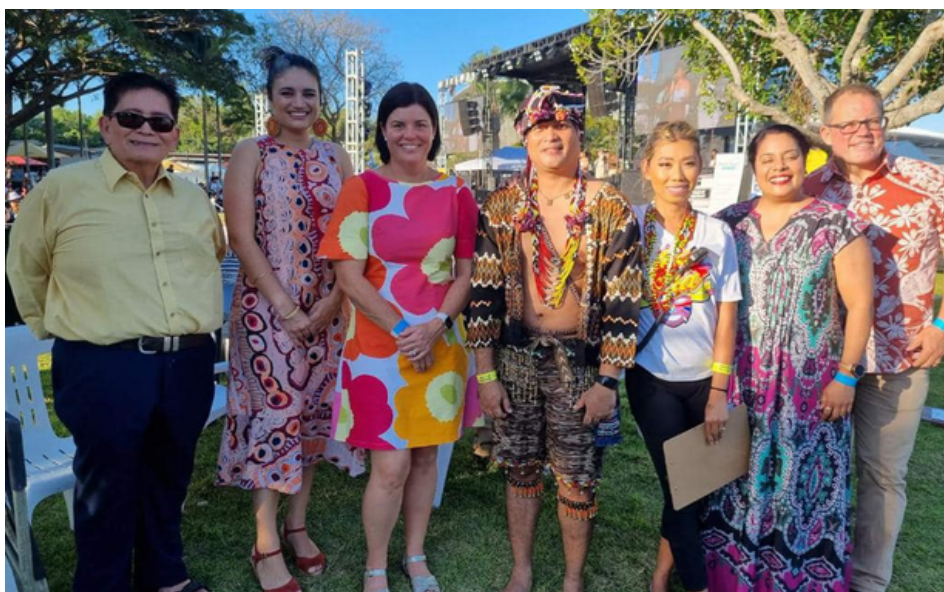
HALA BIRA 2022 - the 25th Barrio Fiesta Celebration, Darwin Waterfront

According to the recent census, the Filipino is the top overseas born Territorians and we aim to serve all of them. The current FAANT Committee was formed in the midst of the pandemic in August 2020. Our initial mission was simple - to gain the trust back from the community by focusing on providing free services, reforming existing events, developing more benefits to financial members and repairing our facility in Marrara to show that we are true to our mission. Support begets support.